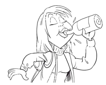
Hypocrite: A person who is not her(him)self on Sunday.